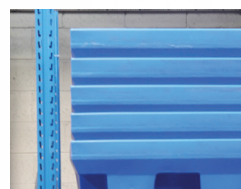
Nestable for transport